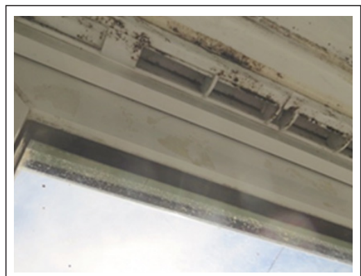
The picture above shows a trickle vent which was stuck to the window frame but without sufficient opening.

It is deemed good practice to have trickle vents fitted in all instances. Where applicable, note should be made of any existing trickle vents. Exceptions are wet rooms which should have separate means of ventilation. The volume of trickle vents should be in accordance with the guidance in Approved Document F. The surveyor should also check to ensure the trickle vent is not oversized.