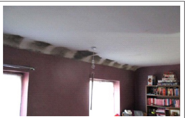
Mould growth to the uninsulated eave section of the roof.

As in the external inspection, visual assessment will form the backbone of the internal checks but should be complemented by the use of surface thermometer, hygrometer and electronic moisture meter. Any areas of visible evidence of condensation and mould should be noted. In almost all instances the first sign of imbalance within the indoor environment is mould growth and condensation. Identification of mould species is normally of very little benefit and provides little diagnostic information, however its presence would indicate that the internal environment is out of balance. The surveyor must be able to identify moisture resulting from high