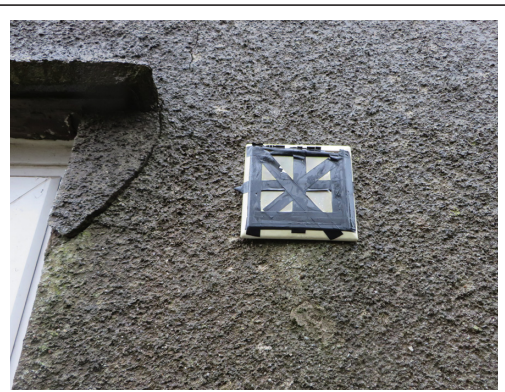
An example of an intermittent fan which had been covered by the occupant. In many instances the alterations may not be so obvious.

Approved Document F says ventilation systems should extract from rooms where moisture production/ pollutants are likely to be released (e.g. kitchens and bathrooms).