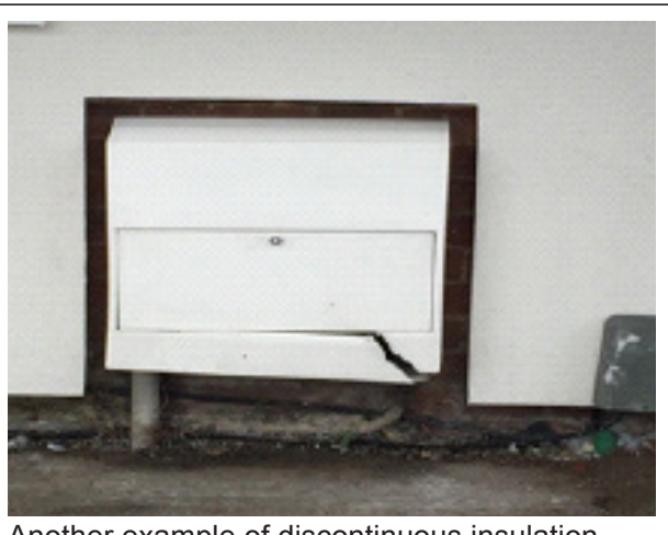
Another example of discontinuous insulation which will result in temperature differentials in the structure and may result in condensation and mould growth problems.

The surveyor should check the external ground levels to all external elevations of the building and a