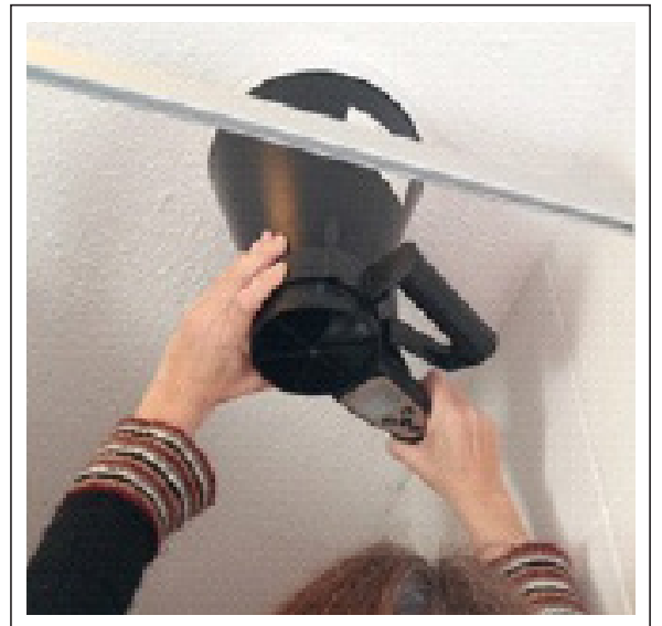
Conditional method of testing using a vane anemometer.