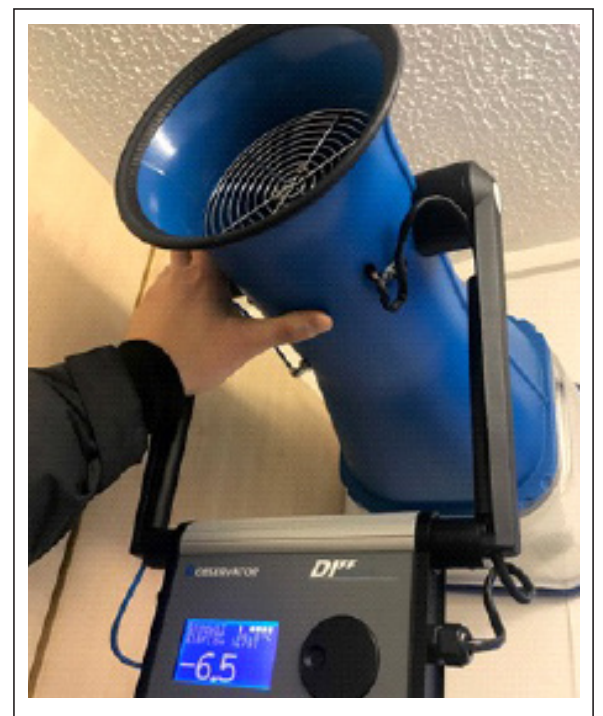
Unconditional method of testing a type 1 ventilation system using a powered hood.