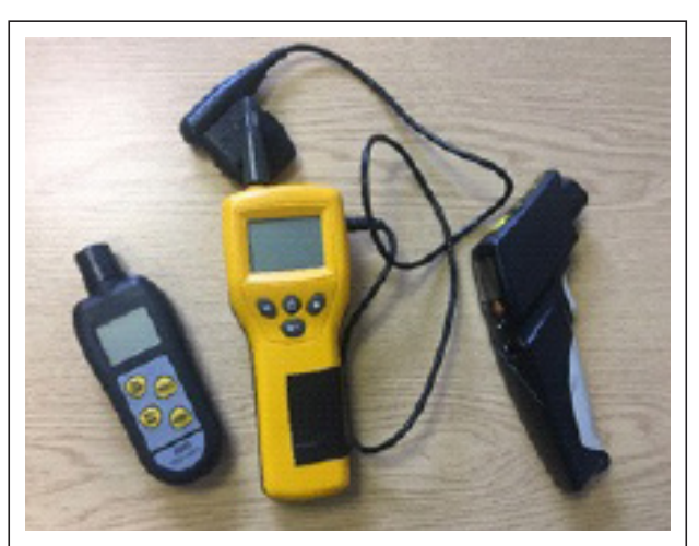
Selection of some of the tools a surveyor should have at their disposal, such as hygrometer, moisture meter and surface thermometer.

However, as a minimum the surveyor should be armed with the equipment detailed in the PCA Code of Practice for the investigation and provision of ventilation in existing dwellings.