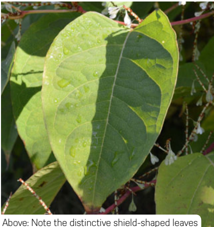
Above: Note the distinctive shield-shaped leaves