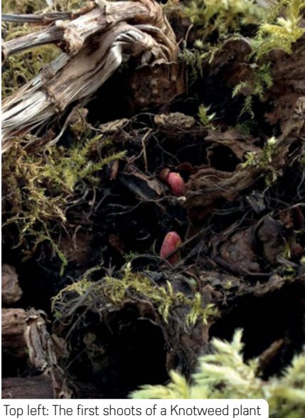
Top left: The first shoots of a Knotweed plant